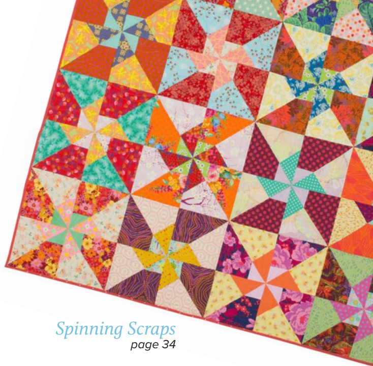
Spinning Scraps page 34