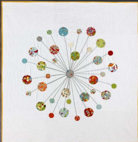
Mid-Century Modern! Casey York